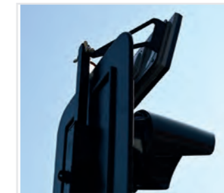
LED-Counter for LZA 500-LED

More information NIS-00295 To be entered on nissen-germany.com