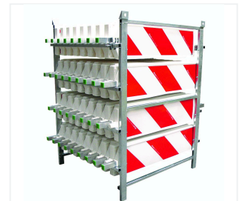
Transport and storage rack