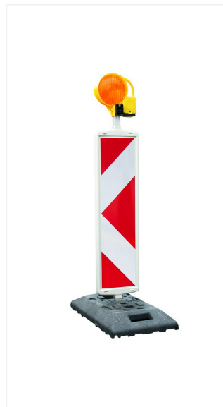
Safety beacon system