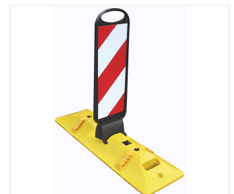
Leitcat-Flex with Tornado 50-Flex