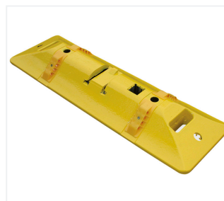
Leitcat-Flex with four reflecting elements