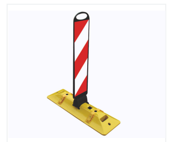
Leitcat-Flex with Tornado 75-Flex