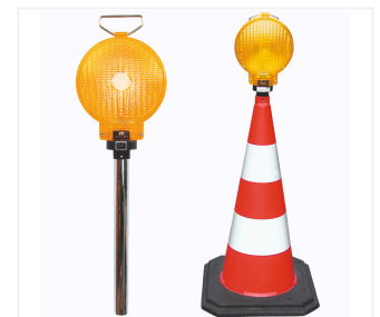
Pin Lamp LED Type 62/S in a traffic cone