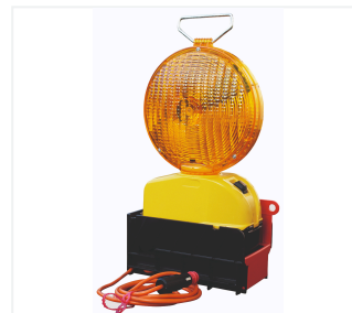
In transport and charging cradle