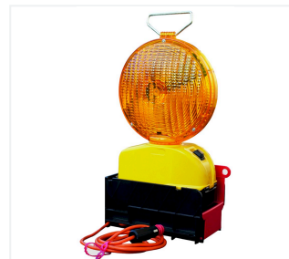
In transport and charging cradle