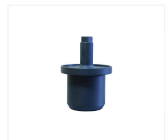
Adapter for traffic cone