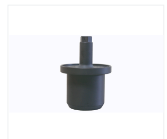
Adapter for traffic cone