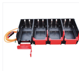
4-fold transport and charging cradle