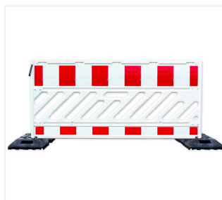
Safety Barrier in base plate