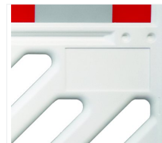
Individual advertising area