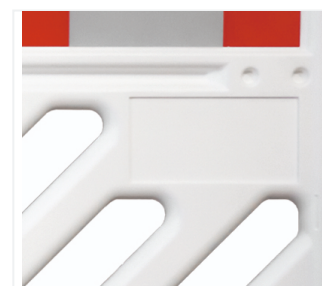
Individual advertising area