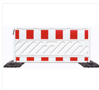
Safety Barrier in base plate