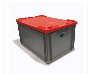
Box for rechargeable batteries