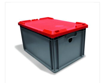
Box for rechargeable batteries