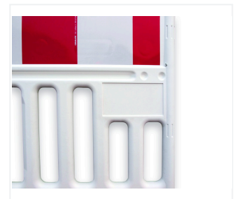
Individual advertising area