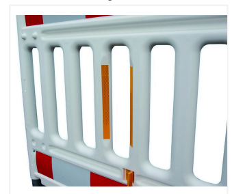
Reflection foil on strut (optional) and reflector