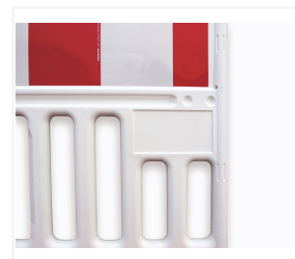
Individual advertising area