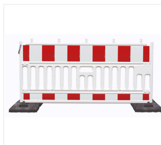
Plastic barrier in base plate