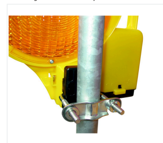
BakoLight with bracket