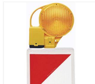
BakoLight LED on a Safety Beacon