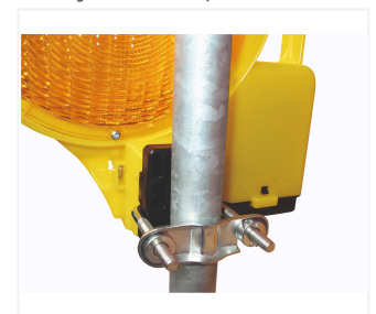
BakoLight with bracket