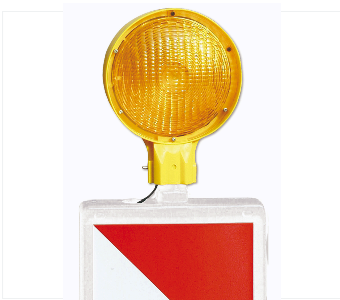
On Safety Beacon