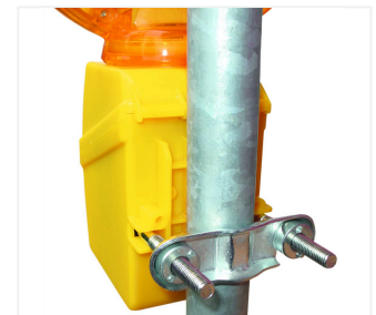
MonoLight with bracket