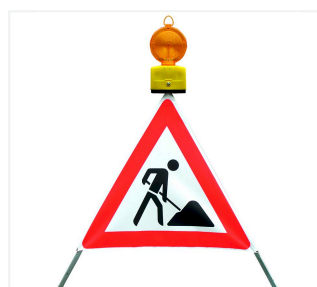
Nitra LED on folding traffic sign