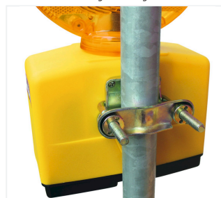
Nitra LED with bracket