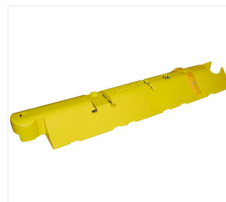
Traffic Guidance System Quick Marker