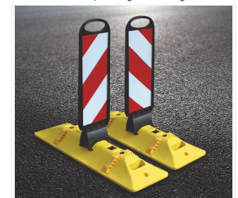
Tornado 50-Flex on Leitcat-Flex