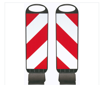
Tornado 50-Flex pointing left and right