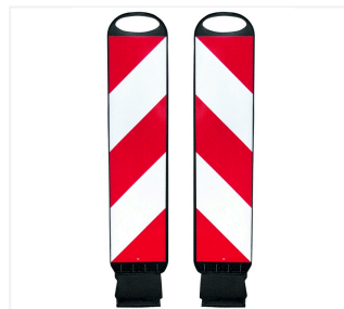
Tornado 75-Flex pointing left and right