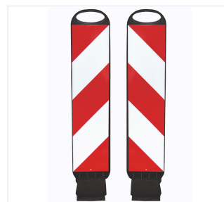
Tornado 75-Flex pointing left and right