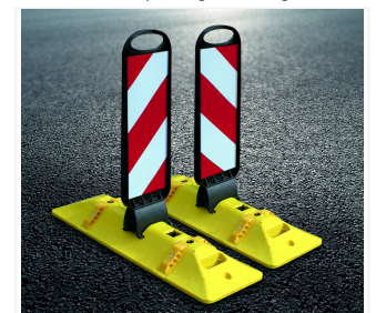
Tornado 50-Flex on Leitcat-Flex