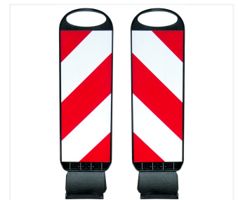
Tornado 50-Flex pointing left and right