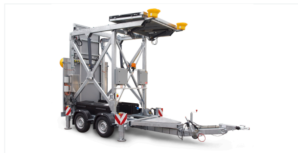
Side view lowered