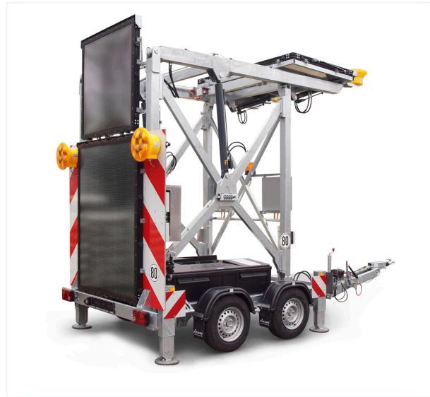
Side view lowered