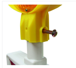
Fixation at a Standard Beacon

With rechargeable battery 12V, 100 Ah 10-fold system - 80 hrs With rechargeable battery 12V, 180 Ah 10-fold system - 140 hrs With rechargeable battery 12V, 230 Ah 10-fold system - 180 hrs