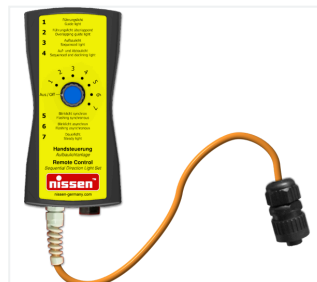
Remote control for Sequential Direction Light Set