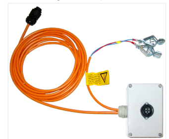
Battery central feed with connector housing