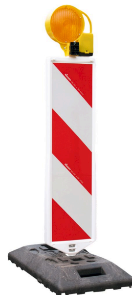
Safety beacon system