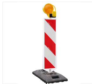
Safety beacon system