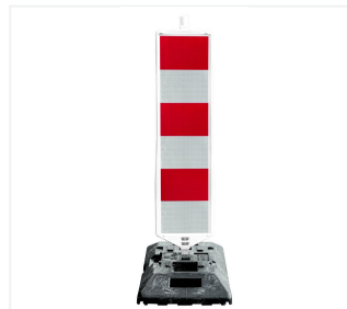
Safety beacon vertical hatched