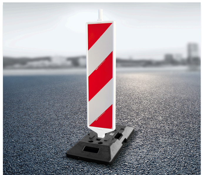
Standard Beacon in base plate K1