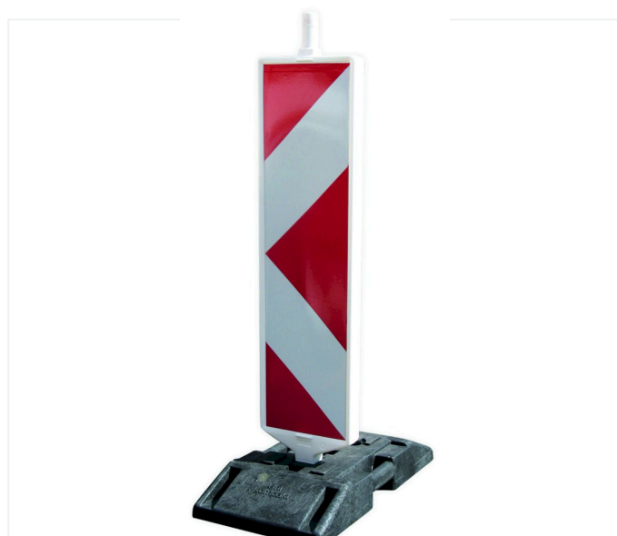
Safety Beacon in base plate Kompakt K1