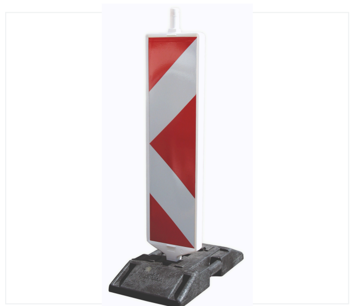
Safety Beacon in base plate Kompakt K1